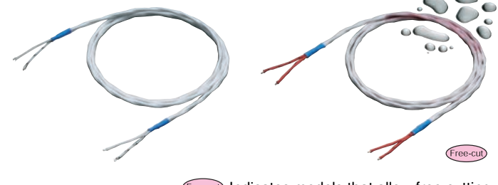
Free-cui Indicates models that allow free cutting.